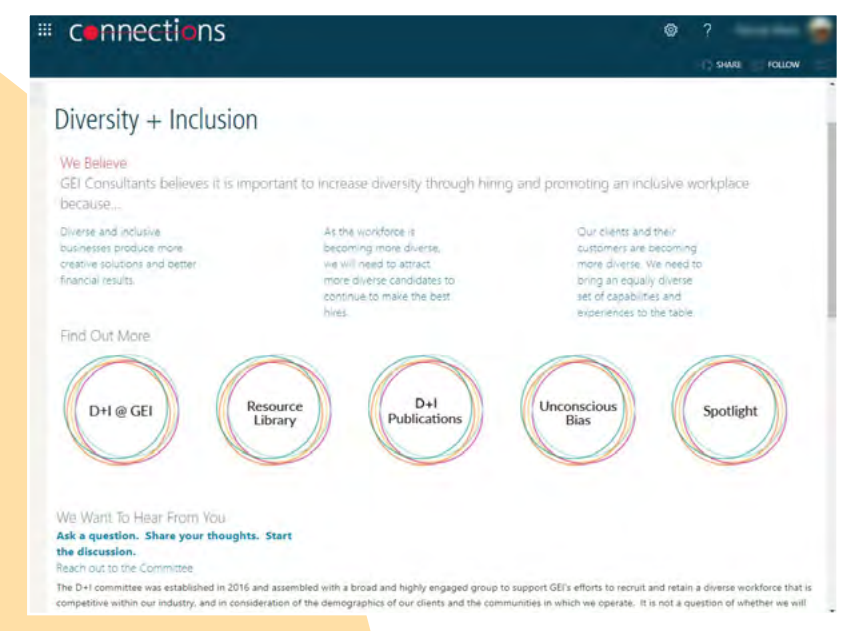
The Diversity + Inclusion webpage is available on GEI Connections.