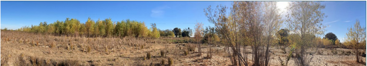
Floodplain restoration.