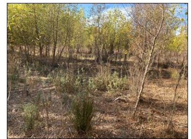
Floodplain restoration.