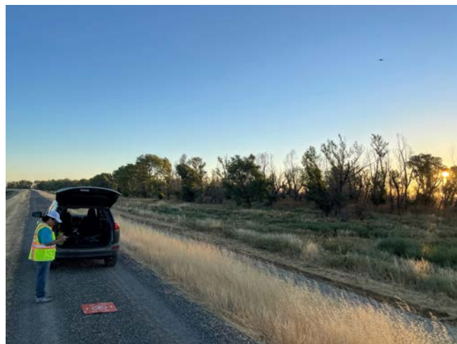
Val Yap piloting a drone