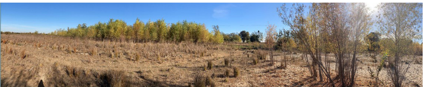
Process-based floodplain restoration, or natural riparian habitat recruitment following a flood event, at the McCormack-Williamson Tract.