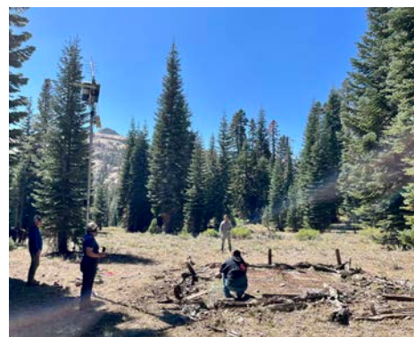
Staff from GEI assisted DWR with recording observations and measurements at one of the snow monitoring sites in the Emigrant Wilderness