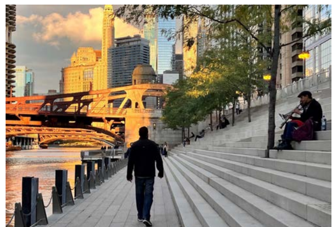
Strolling Chicago's restored Riverwalk, during an authors' workshop for the National Levee Safety Guidelines.