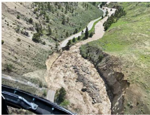
This summer's storms wrought catastrophic damage to roads in Yellowstone National Park.

Eight Weeks and Four Floods: How Understanding Compound Weather Events Can Help You Predict and Manage Emergency Weather ( https://www.geiconsultants.com/thought_leadership/compound-weather-events/ ). Over the summer of 2022, the U.S. weathered a “thousand-year flood” on an average of every other week. These events ravaged communities from California to Missouri, from Wyoming to Kentucky. None were caused by an exceptional hurricane or even a named storm. Rather, each of them was what is called a “compound event” or weather catastrophe caused by the collision of two or more weather patterns. To better predict, avoid, and manage emergency weather, we need to understand how and why devastating impacts come not just from huge weather events like large hurricanes, but also from the interactions of much smaller weather patterns.