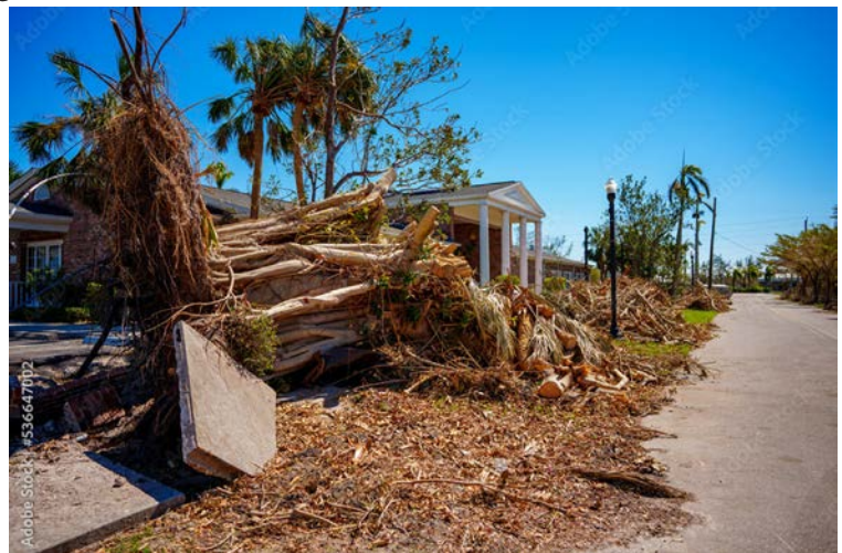
A tree is uprooted but a house still stands in Punta Gorda, FL, after Hurricane Ian.